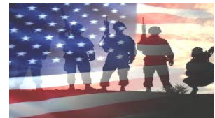
REMEMBER Those who FOUGHT