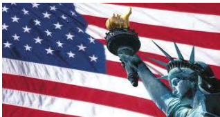
The FLAG STANDS for FREEDOM

A BIG THANK YOU to all members of the Brighton Work Group!!!